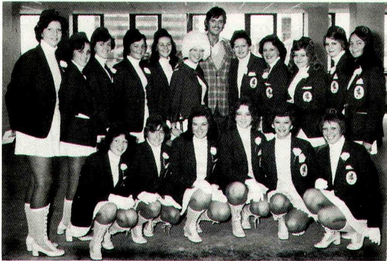
SWINDON TOWN GIRLS WITH SIMON WILLIAMS OF 'UPSTAIRS & DOWNSTAIRS